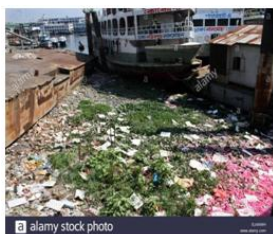
The Buriganga River

The Buriganga River is closely connected with history, culture, livelihood, economy of 400 years old capital of Bangladesh. This river was once called the life of Dhaka but presently marked as a dying river. The river still continues to play a very important role, since an average of 30000 people use the Sadarghat launch terminal for departure and arrival every day (The Daily Star, April 01, 2009). Among the six rivers of Dhaka City, the Buriganga stands in the most vulnerable situation. The worsening water quality of the Buriganga is the major concern of the Environment Department of Bangladesh. “The major point sources of pollution in the Buriganga River are a number of industrial installations, municipal wastewater and sewage treatment plants.” (Rahman & Rana) The second worst conditioned river of Dhaka city is the Turag River. This river is badly experiencing river filling by powerful political leaders and different Group of Companies. Notably, the third bridge of Basila of the Turag River is the highest pollutant area. There are twenty nine heavy industries beside this river that are continuously dumping industrial waste with poisonous chemicals. Heavy metals frequently reported in literature with regards to potential hazards and occurrences in contaminated soils are Cd, Cr, Pb, Zn, Fe and Cu. So, it is very clear that the Thames of the modern times is similar to the rivers of present Dhaka city.