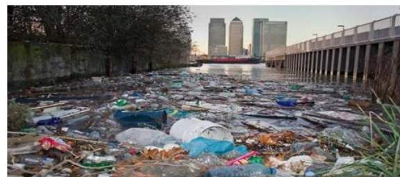
Plastic waste is now the biggest risk

The Thames River, popularly believed a part of Isis, is the longest river in England covering 215 miles (346 km) and the second longest river in the United Kingdom. The Thames River was contaminated by industrial waste, human waste and plastic waste in modern times. Some of the sewerage pipes were badly damaged by the wartime bombing which helped to keep the river clean. In 1957, the Natural History Museum declared the Thames biologically dead, it was a vast, foul-smelling drain." "No oxygen is to be found in it for several miles above and below London Bridge", was reported by The Manchester Guardian in 1959.