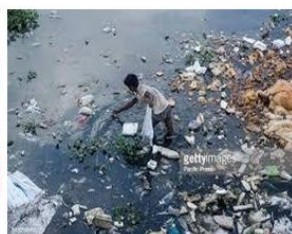
The Turag River

Riverside Prostitution: Riverside prostitution is the next related topic. Prostitution is considered as the World’s oldest profession, indicates of engaging in sexual activity in exchange of money. It is a wicked