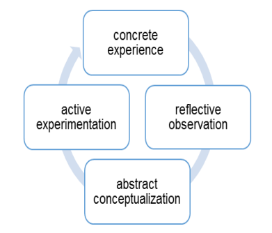
Figure 1: Experiential learning cycle. From Kolb, 1984

It is worth noting that Kolb's theory is grounded in the experiential Model of Kurt Lewin which postulates for learning processes or modes. The first mode involves concrete experiences. Kolb (1984) described this mode as "the focal point for learning, giving life, texture, and subjective personal meaning to abstract concepts and at the same time, providing a concrete, publicly shared reference point for testing the implications and validity of ideas created during the learning processes". Concrete experience is followed by a period of reflection and observation which leads to abstract conceptualization. The fourth mode of learning is active experimentation in which abstract concepts are tested and applied to the learning situation. The learner grasps their experimentation as a new level of concrete experience, and the learning process continues in a circular fashion as follows: