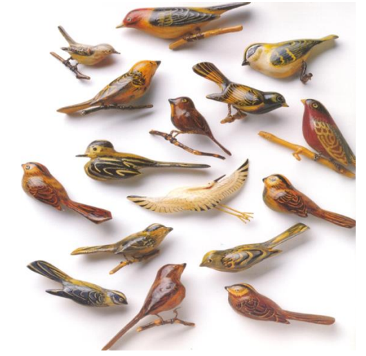
Figure 8. Carved birds. [ The Art of Gaman (p. 76), by Delphine Hirasuna, 2005]

Both Tule Lake in California and Topaz in Utah were situated on dry lake beds, but the internees found out that the landscape was scattered with tiny shells. When they started digging a few feet deeper, they discovered innumerable number of shells hidden underneath. They took the shells out, sorted them by shapes and sizes, bleached them and then painted them in different colours. These shells were painstakingly assembled and made into brooches, necklaces and corsages.