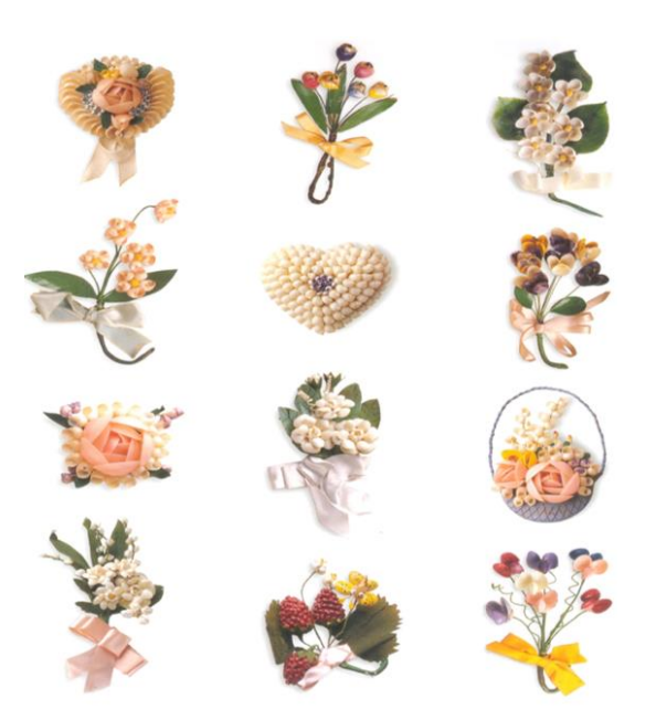
Figure 7. Shell corsages. [ The Art of Gaman (p. 52), by Delphine Hirasuna, 2005]

Caged within government-made ghettoes, they looked for ways to fill their time. The things made in the American internment camps were made mostly from scrap and discards – packing crates, cardboard boxes, wrapping papers, gunnysacks, wires, tin cans, toothbrush handles and so on. Virtually nothing was thrown away without reexamining its craft-making possibilities. People at each camp tried to create something beautiful with the indigenous materials around them. Tule Lake became famous for the objects made from shells, Minidoka for the stone carvings, Topaz for the objects carved from slate, Jerome and Rohwer for the hardwood furniture and Manzanar for the carved wooden bird pins.