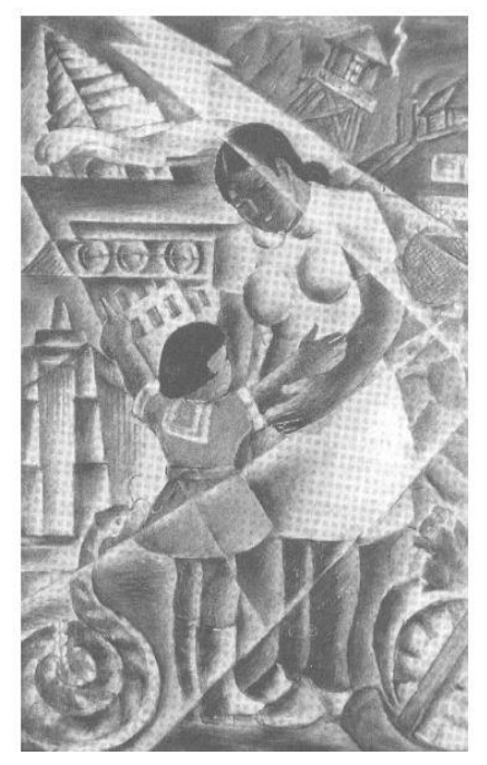
Figure 4. Henry Sugimoto, When Can We Go Home? , 1943, Oil on Canvas, Japanese American National Museum.

Since art materials were not easily available, he painted on almost anything he could find – sheets, pillowcases, canvas mattresses, covers. Sugimoto's "When Can We Go Home?" is a remarkable work of art which consists of two sets of striking visual images – one, representing the world outside and the other, inner world of the camps. These images seem to swirl around the two central characters on the canvas, a mother and her child, supposedly asking her the question, 'when can we go home?' One can easily discern that the right side contains images of the internment camps: a guard tower, a storage barn. The left half shows images of the outer world -- a skyscraper, a train, a bridge – all of which signals freedom and movement.