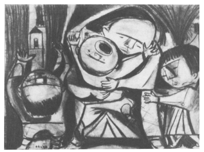
Figure 5. Mine Okubo, Evacuee Mother and Her Children , 1943. Collection of the artist, Japanese American National Museum.

identity was reduced to a number]. Combining "citizen" with the prison number "13660" indicates the irony of the entire situation. In her charcoal drawings, Okubo powerfully portrays feelings of sorrow, humour, pain, happiness – something which have been overlooked in the context of the war.